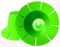
MiTi Plug (part # MP series) 250 per box

MTi GROUP offer an extensive range in blocking products for the mining industry. All blocking products have been selected for ease of use and to create a varied and extensive range of options to suit your particular situation. With consideration of the broad conditions and circumstances you encounter MTi Group have designed diverse top quality blocking products at competitive prices.