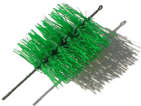
Slump-Stoppa Bottle Brush (part # SS series) 48 per box

The spiders have been specifically designed to assist in up hole loading in broken ground. The tapered leading edge allows the primer unrestricted passage without hanging up or locking in the hole. This ensures safe deployment and fast location to the desired depths. The spiders are made with reinforced legs to lock the primers in place so they don't move during loading and the undercuts that form part of the body lock on to all manufacturers primers. The design of these spiders is unique combining function with durability where the plastic has been selected to withstand impact but be rigid enough to hold tightly onto primers to avoid the need for tape to secure.