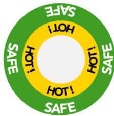
Incorrectly stored T=122F