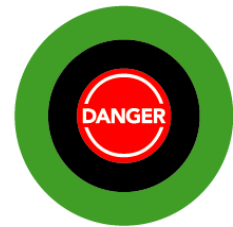
Product <122F Use with caution