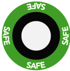
Safely stored T<122F